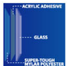
XDS system installed on glass

There are two parts to the system. One. A super tough mylar polyester with a scratch-resistant coating. Two. A specially formulated & proprietary high temperature acrylic adhesive, which when applied to the glass, actually infiltrates the glass pores, gets absorbed and hardens, to strengthen the glass itself.